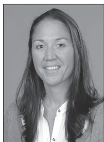
MORGAN VALLEY Assistant Coach First Season